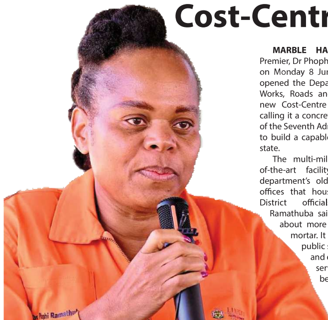
Limpopo Premier, Dr Phophi Ramathuba urged public servants to render quality of services from the newly opened Public Works, Roads and Infrastructure's new Cost-Centre in Marble Hall.

MARBLE HALL - Limpopo Premier, Dr Phophi Ramathuba, has on Monday 8 June 2026 officially opened the Department of Public Works, Roads and Infrastructure's new Cost-Centre in Marble Hall, calling it a concrete demonstration of the Seventh Administration drive to build a capable, developmental state.