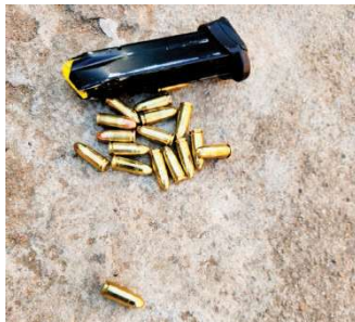
Unlicensed firearms and ammunition were recovered by the police during the Limpopo Province-wide Operation Shanela.