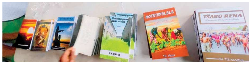
Some of the books on display