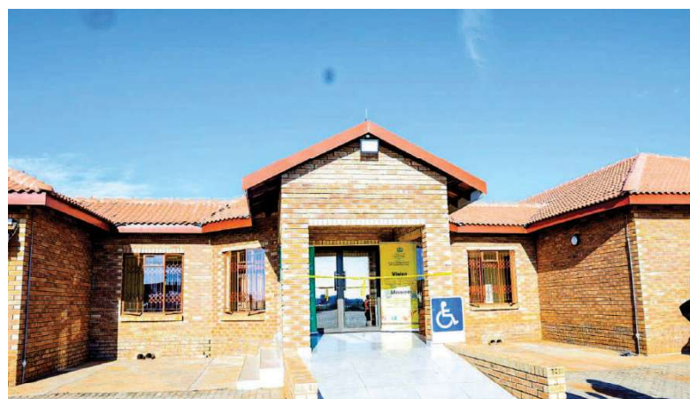
The newly opened Marble Hall Cost-Centre forms part of a wider provincial push to modernize government infrastructure.