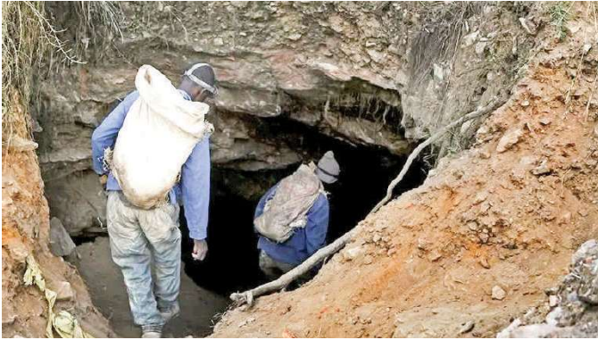
The DA in Limpopo raised grave concerns over the escalating illegal mining crisis, which they say is devastating farming and rural communities in the province.