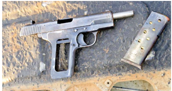
Unlicensed firearms with ammunition were seized by the police during the arrests of the suspects.