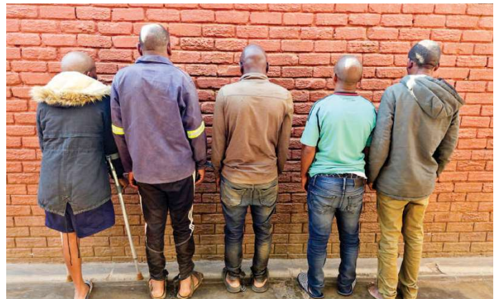
An intelligence-driven coordinated Operation Vimpire resulted with five suspects arrested and linked to a brazen garage safe-bombing in Driekop.