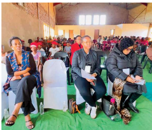
The attendees at the event.