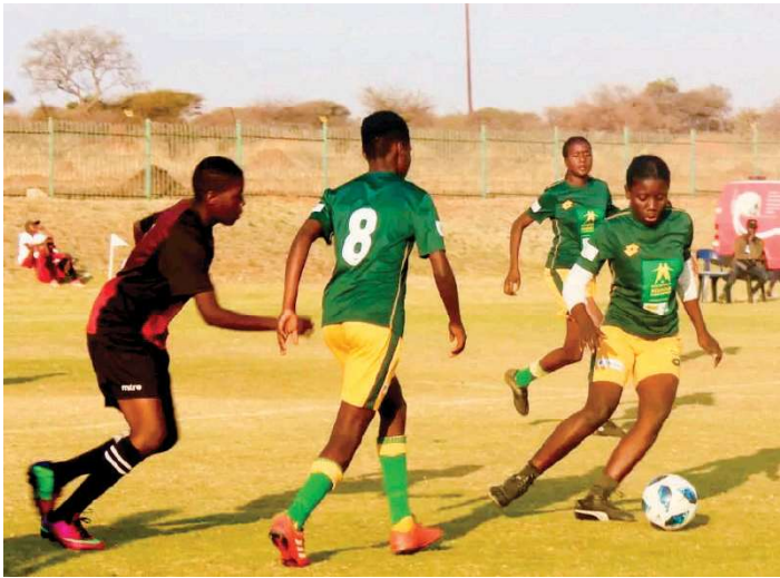
SAFA Sekhukhune Region in partnership with SDM will conduct SAFA D License course to promote the development of football in Sekhukhune Region.

SEKHUKHUNE - Sekhukhune football coaches are set to level up their qualifications as the SAFA Sekhukhune Region announces a SAFA D License course for local clubs and schools. The course will be conducted by SAFA Sekhukhune Region in partnership with Sekhukhune District Municipality (SDM).