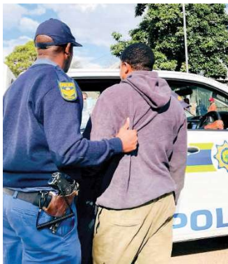
The Limpopo Police Operation Shanela conducted across the province has resulted in arrests of suspects for various criminal offences.